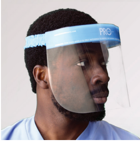
FM89010 Face Shield, Full Length, Foam Top, Elastic Headband