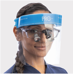
FM89011 Face Shield, Full Length, Loupes Headlight Cut-Out, Foam Top, Elastic Headband