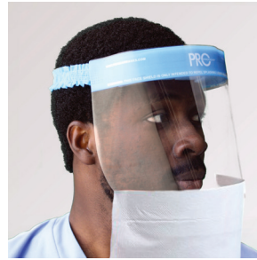
FM89012 Face Shield, Full Length, 11" Drape, Foam Top, Elastic Headband