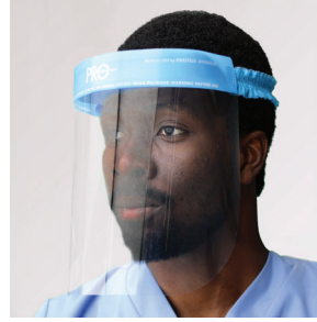
FM89030 Face Shield, XL Length, Foam Top, Elastic Headband