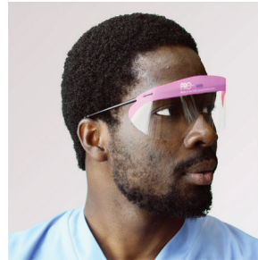
FM89111 Pre-Assembled Disposable Glasses, Pink

100 glasses per case Packed in 10 bags of 10 each